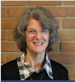
Marcia Harten Youth Leadership Fund